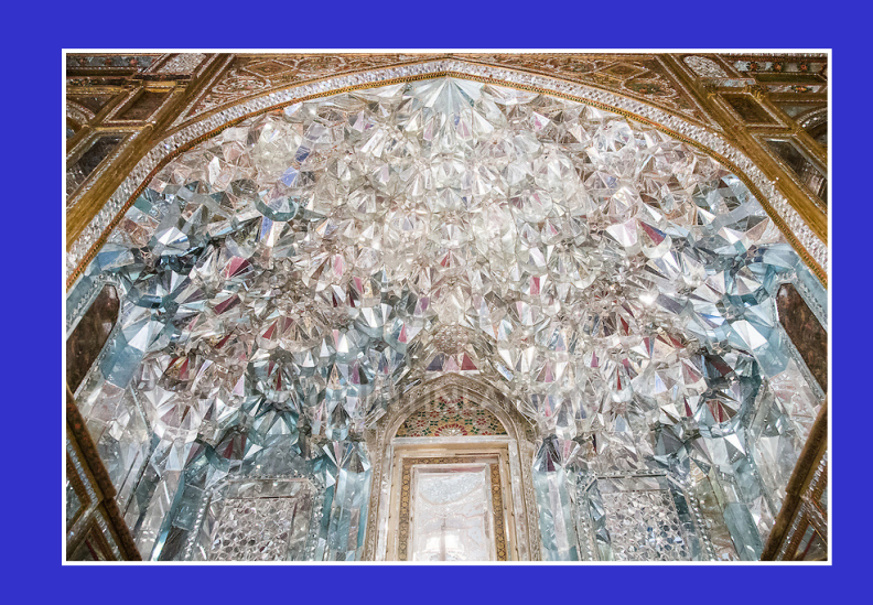
Royal Palace of Tehran in Iran