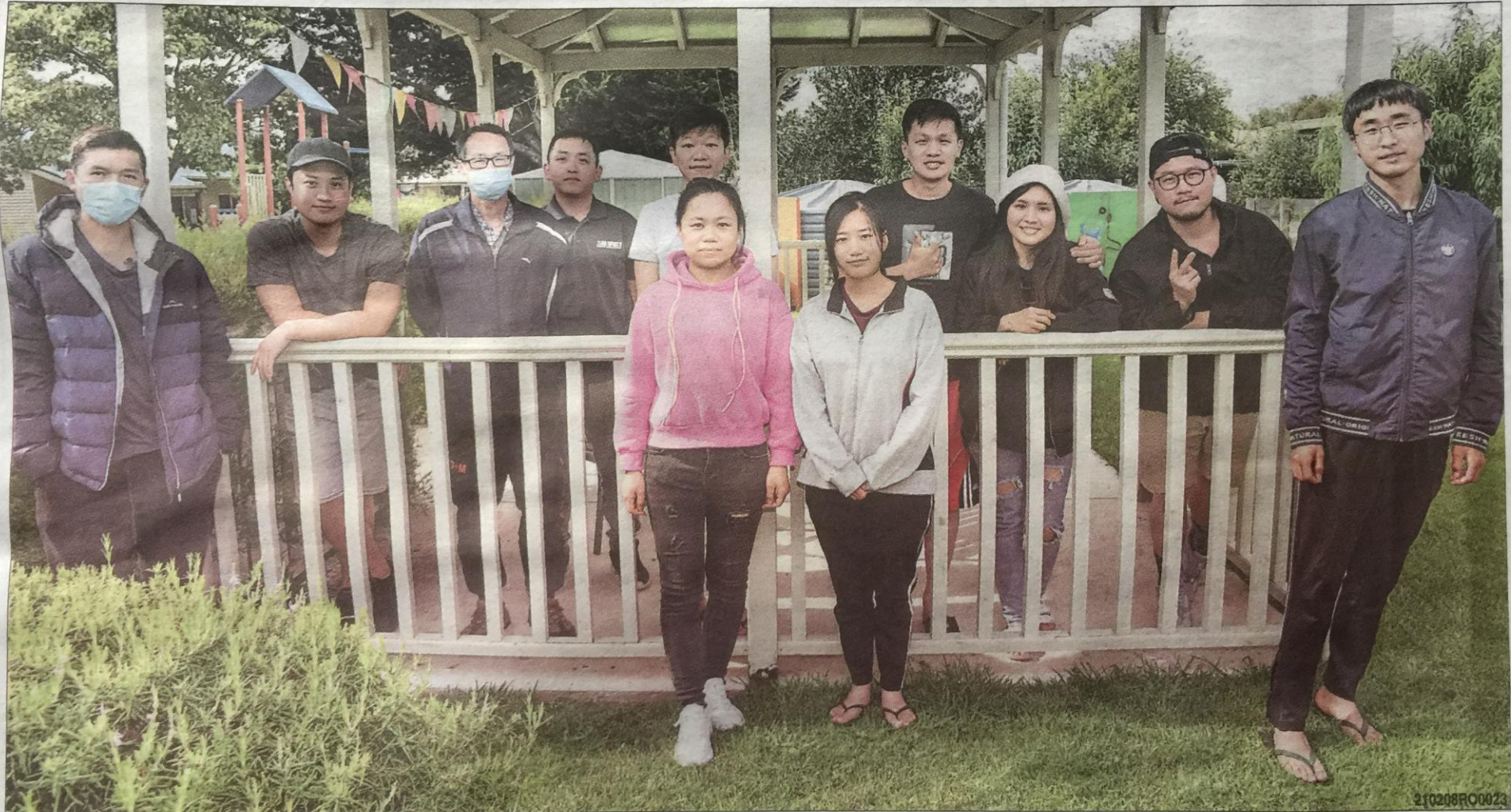
CONNECTION: Members of Colac's Chinese community pictured at an English class at Colac's Neighbourhood House. The classes are a joint initiative between the neighbourhood house and Diversitat. Chinese-Australians are looking forward to annual Lunar New Year celebrations starting on Friday.