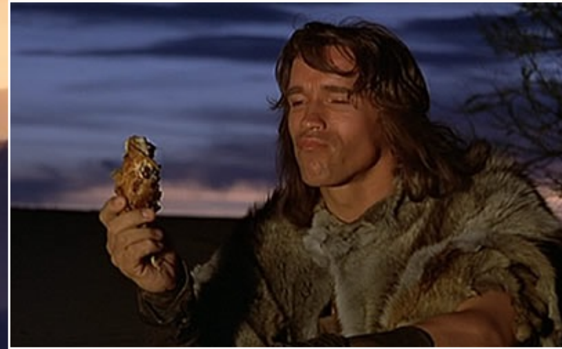
Arnold Schwarzenegger 'Conan the Barbarian'

Christ's divine resurrection power that enables us to discover the hope of our calling which in turn produces a divine inheritance for God.